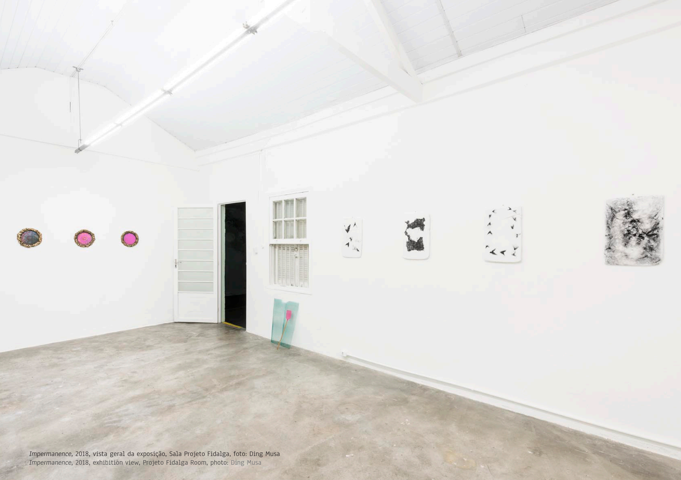
Impermanence , 2018, vista geral da exposição, Sala Projeto Fidalga, foto: Ding Musa Impermanence , 2018, exhibition view, Projeto Fidalga Room, photo: Ding Musa