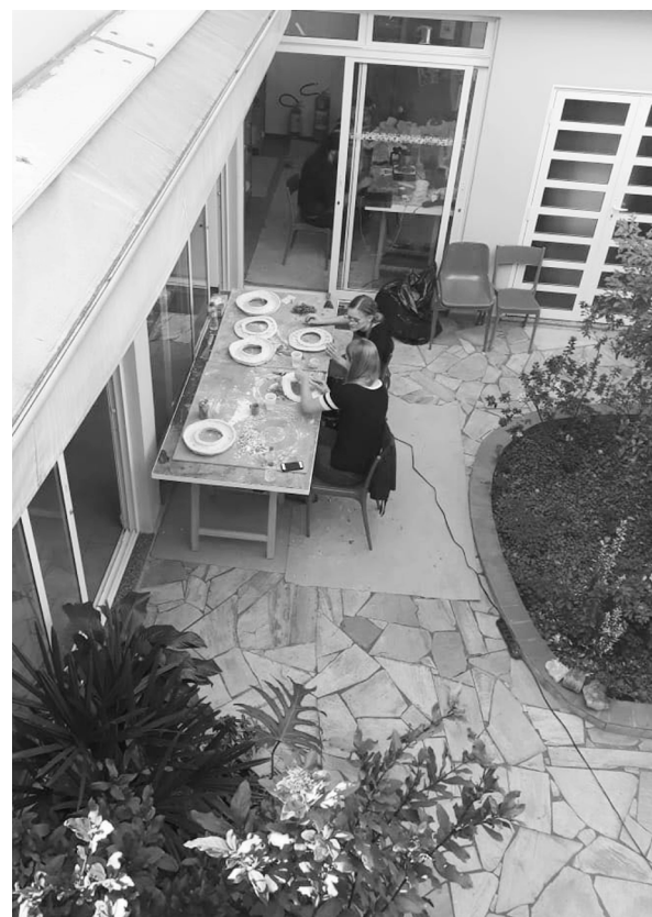
Artistas trabalhando durante a Residência Paulo Reis | Artist working during the Paulo Reis Residency