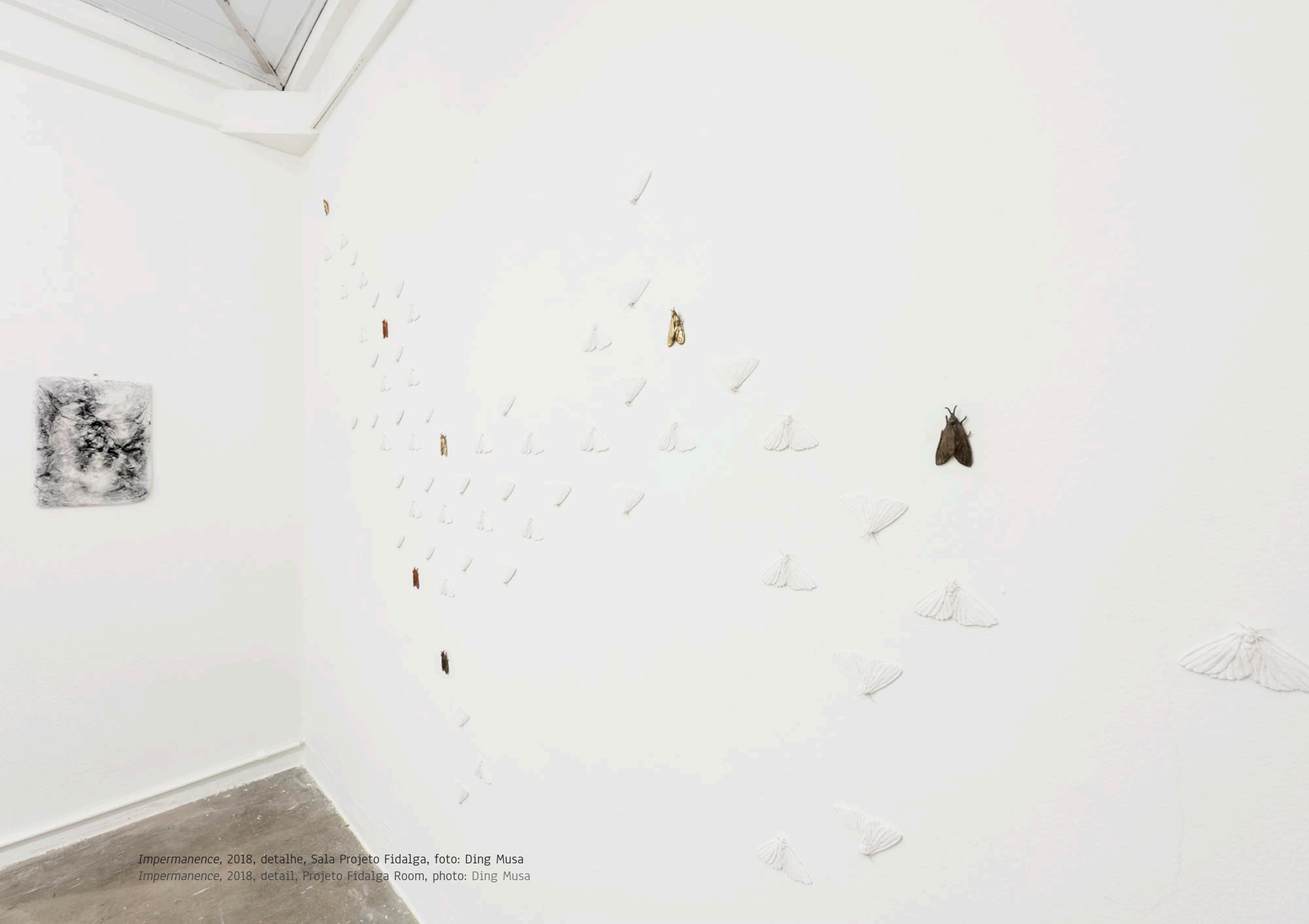
Impermanence , 2018, detalhe, Sala Projeto Fidalga, foto: Ding Musa Impermanence , 2018, detail, Projeto Fidalga Room, photo: Ding Musa