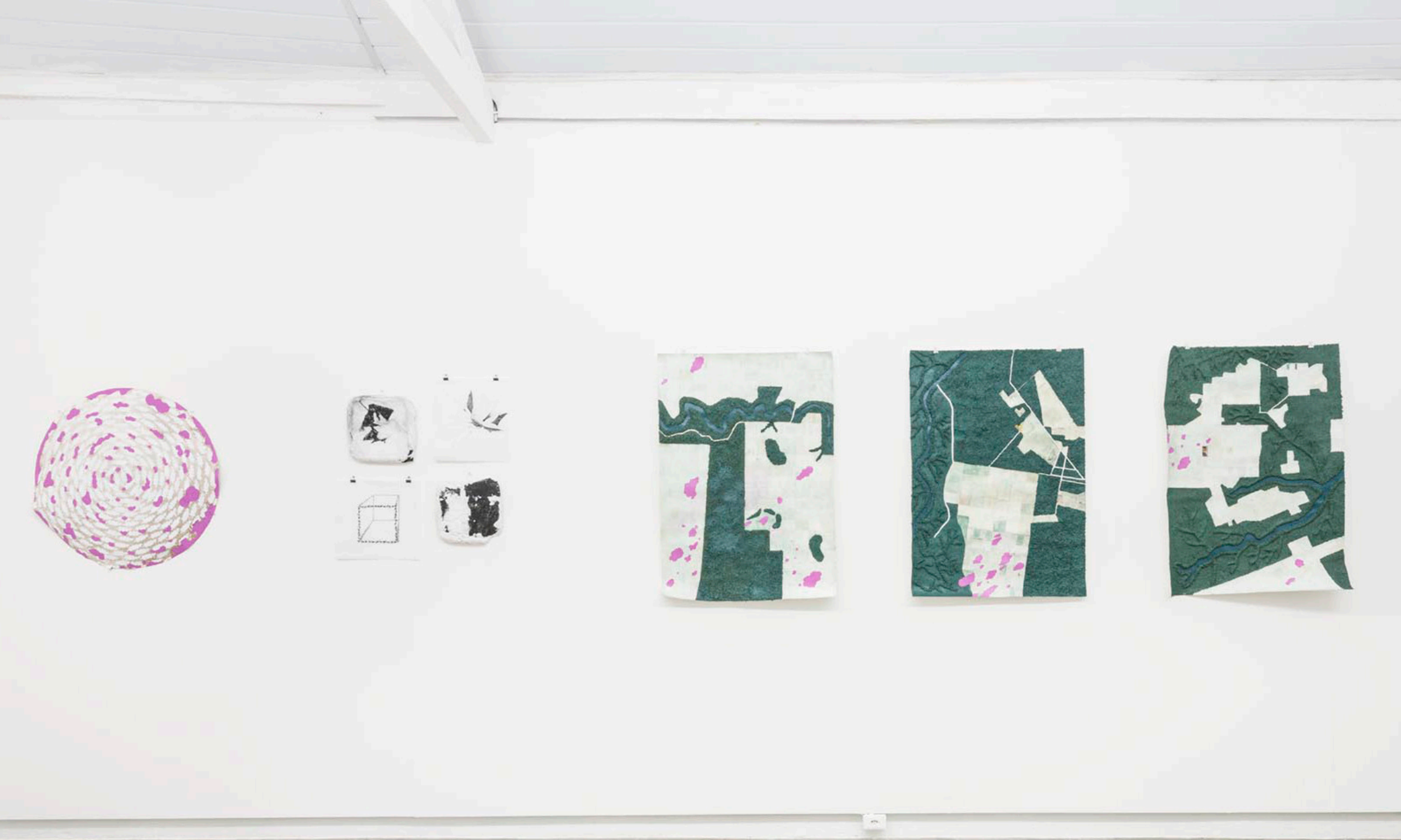
Impermanence , 2018, vista geral da exposição, Sala Projeto Fidalga, foto: Ding Musa Impermanence , 2018, exhibition view, Projeto Fidalga Room, photo: Ding Musa